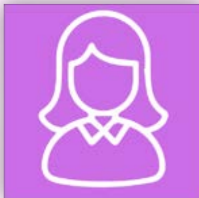
Could Be You

Speakers for the "Work Site" breakout rooms should bring real-world case studies that illustrate how to navigate organizational hierarchies and advocate for essential resources within a professional environment. They should be prepared to offer actionable frameworks for handling high-stakes conversations and "managing up" with confidence and strategic clarity. By sharing personal insights on communicating with authority, these leaders will help participants bridge the gap between theoretical leadership concepts and everyday workplace application.